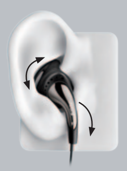
Right headphone ergonomics

Great sound in a headset depends on quality speakers and a perfect, secure fit. The headset units are ergonomically shaped to fit your ears. For optimal comfort and sound, make sure which headset unit is for the right and for the left ear. It is marked on every unit with R and L.