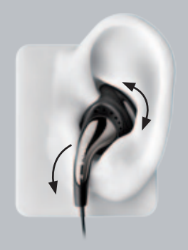
Left headphone ergonomics