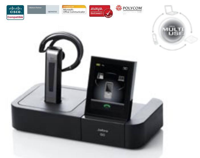
GN Netcom is a world leader in innovative headset solutions. GN Netcom develops, manufactures and markets its products under the Jabra brand name